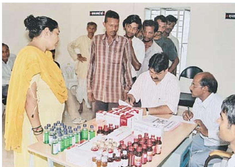
In-house pharmacy store