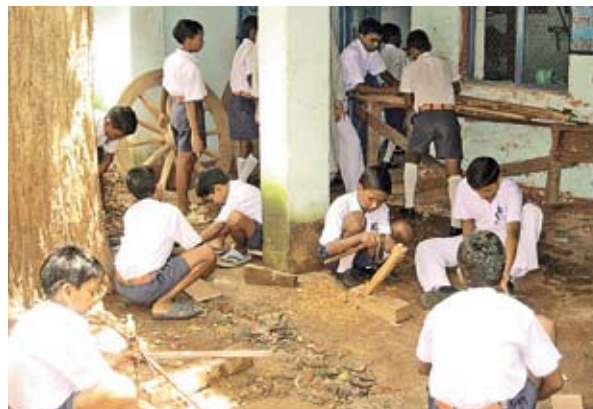
Training students from tribal population through sustainable education (training in carpentry, agriculture)

them carve out a viable vocation in their own territory, thereby promoting employment in immediate vicinities, without migrating to the already overcrowded urban centers. This dove-tailing of sustainable employment will in turn lead to a better standard of life and living all around and thus shall eventually lift the population of these tribal areas above poverty line, into a realm of dignified equality.