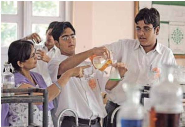
Learning science and technology

Ram Ratna Vidya Mandir will try to emulate the Vedic Gurukul system built on relationship between Guru and Shishya that provides strong emotional moorings to the student during his formative years and imparting knowledge in science and technology blended with ancient Gurukul values.