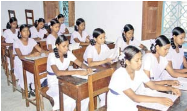
Imparting knowledge blended with ancient Gurukul values

The endeavour is not just to impart education in the literal sense but to create an atmosphere that will help inculcate character and cultural values in the students and send back a multi-faceted personality to the society.