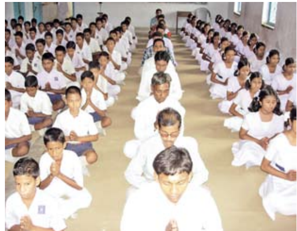
Inculcating character and cultural values in the students

Further people of Indian origin have settled across the globe for nearly for over four generations. They are also the torch bearers of Indian global interests. As they look at their mother land to provide spiritual solace and cultural moorings, Ram Ratna Vidya Mandir fills the need by providing their children the right kind of education.